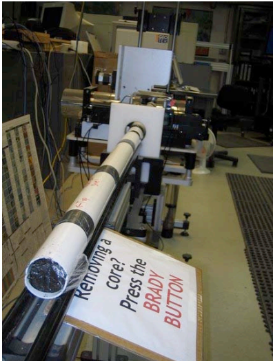
Figure 3 Multi-sensor core loggers.