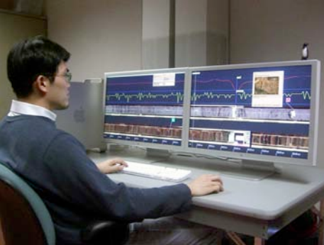
Figure 4 CoreWall setups with tiled displays.