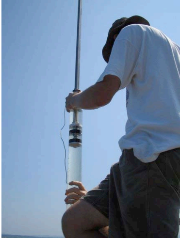
Figure 2 Core Drilling on Lake Pepin.