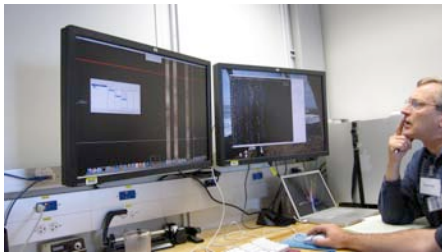
Figure 9 CoreWall systems used in the next generation US. JOIDES Resolution scientific drilling vessel.

Dr. Talarico's hand drawings stretch out of his office and down the hallway as shown in Figure 7.